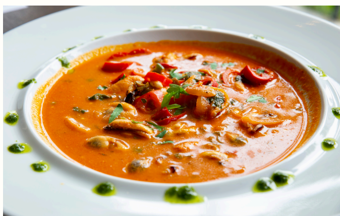
CHICKPEA & SPINACH SOUP E55