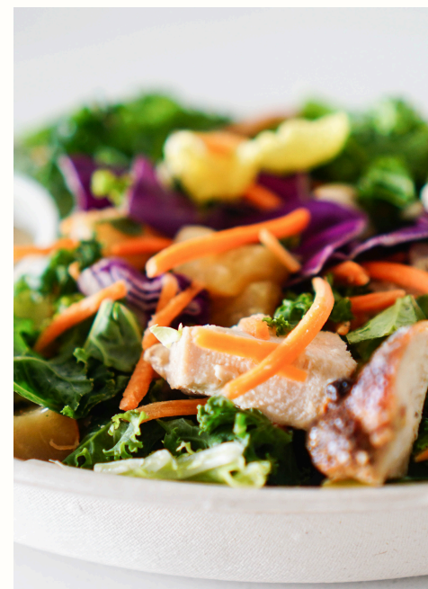
TUNA SALAD E60