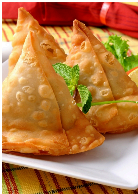
SAMOSAS - 3 UNITS E36